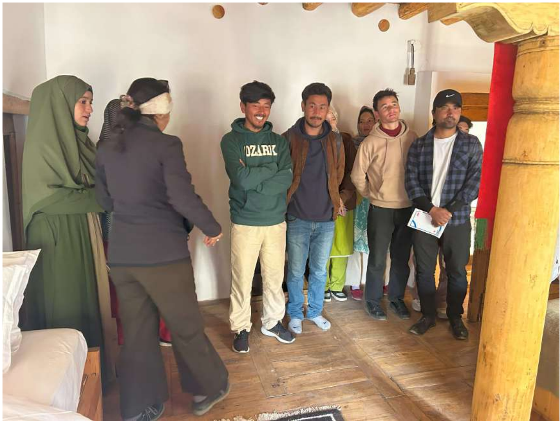
Pic-2: Students learned about housekeeping management of eco-resort.