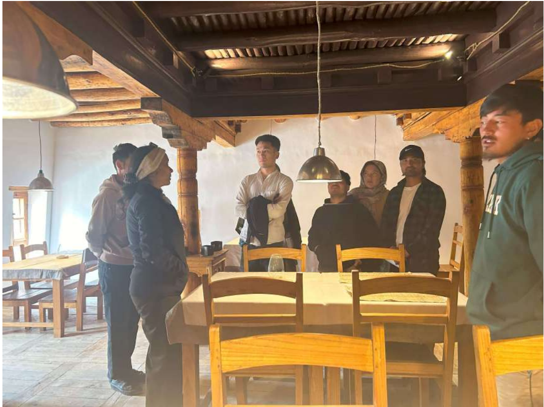
Pic-4: Students learning about F & B department and hospitality etiquette.